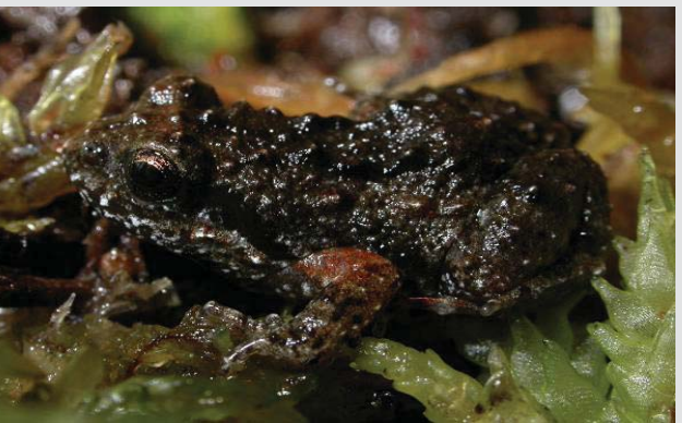
Arthroleptella rugosa is the only new frog described in South Africa since 2004 and joins the Red List in 2010 as Critically Endangered.

as Data Deficient (DD) in 2004 had sufficient data obtained to make full assessments. Of the threatened species, 8 were downlisted (2 CR to EN, 1 EN to VU, 2 VU to LC and 3 VU to NT) while 3 were uplisted (2 EN to CR and 1 VU to EN). Full details of all threatened amphibian species in South Africa (assessed by SA-FRoG & IUCN SSC Amphibian Specialist Group) are detailed in an appendix of the book