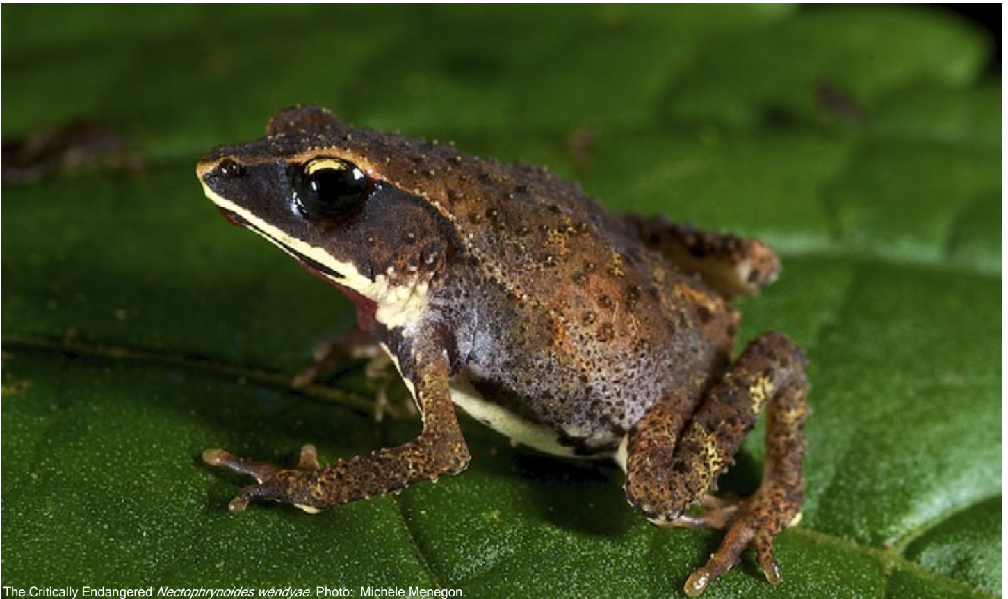
The Critically Endangered Nectophrynoides wendyae.

The next meeting of the African Amphibian Working Group will take place in Uganda in two to three years' time. Watch for announcements in future issues of FrogLog .